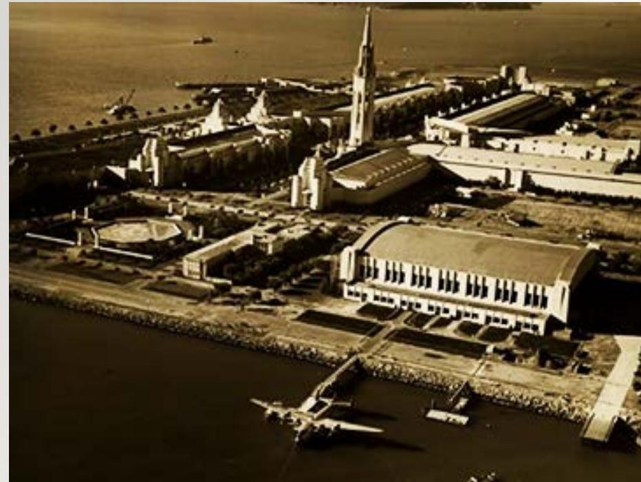
Golden Gate International Exposition, World's Fair – 1939/1940